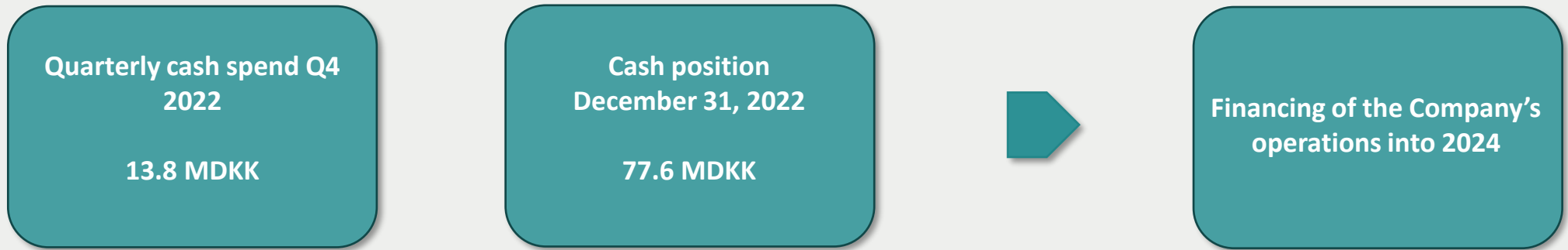
Operating Expenses 2021 - 2022